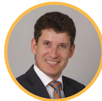
Rigo Wenning W3C